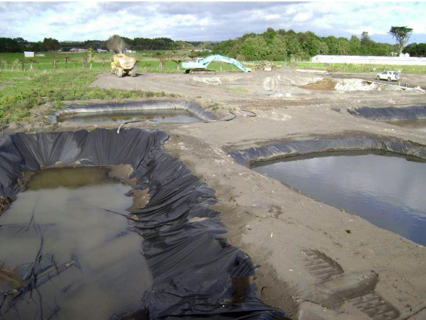
Lined storage pits at Wellington site, BTW Brown Road landfarm, TRC report 9887702, 2012.