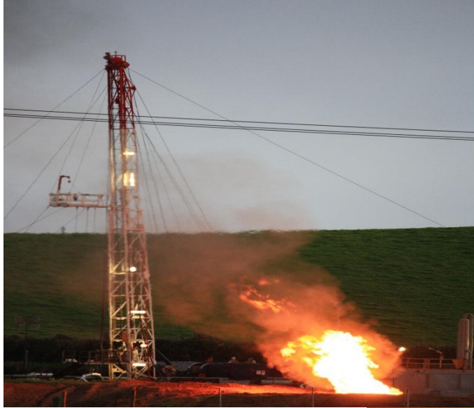
Flare at NZEC's Copper Moki wellsite, Taranaki, June 2012.