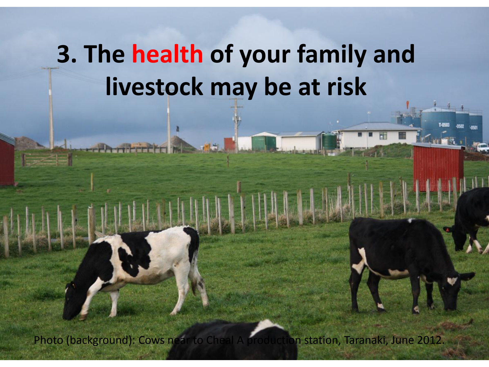
Photo (background): Cows near to Cheal A production station, Taranaki, June 2012.