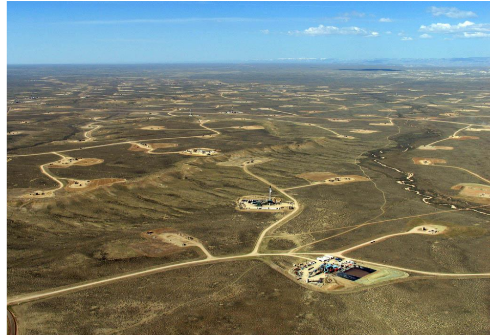
Aerial view of Jonah field (Wyoming, USA)