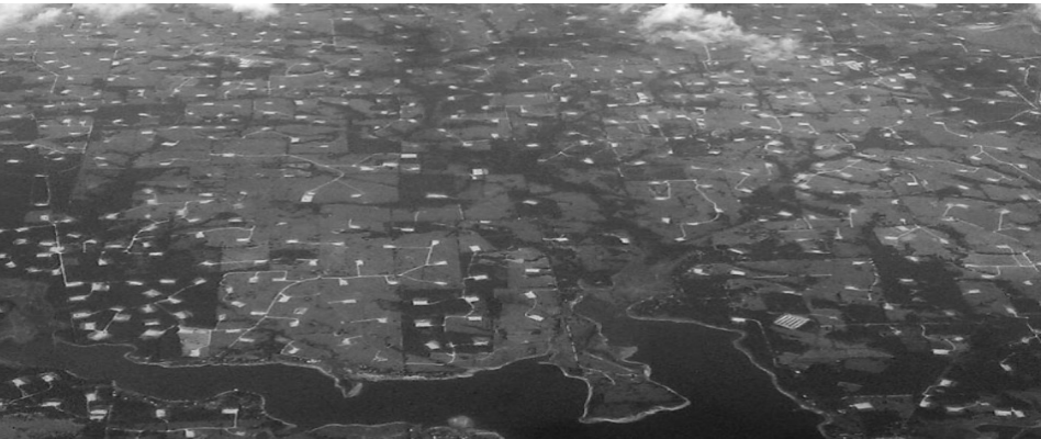
Aerial photograph showing the results of a widespread unconventional drilling campaign on Texas. Photo shows well pads, roads and pipelines, taken by Amy Young 2013.

Although Tag has interest in conventional and unconventional production, they recently raised twenty-five million dollars in finance, employed two US fracking experts and reported; with 2,720,358 acres to prospect Tag Oil is anticipating a "widespread unconventional drilling campaign."